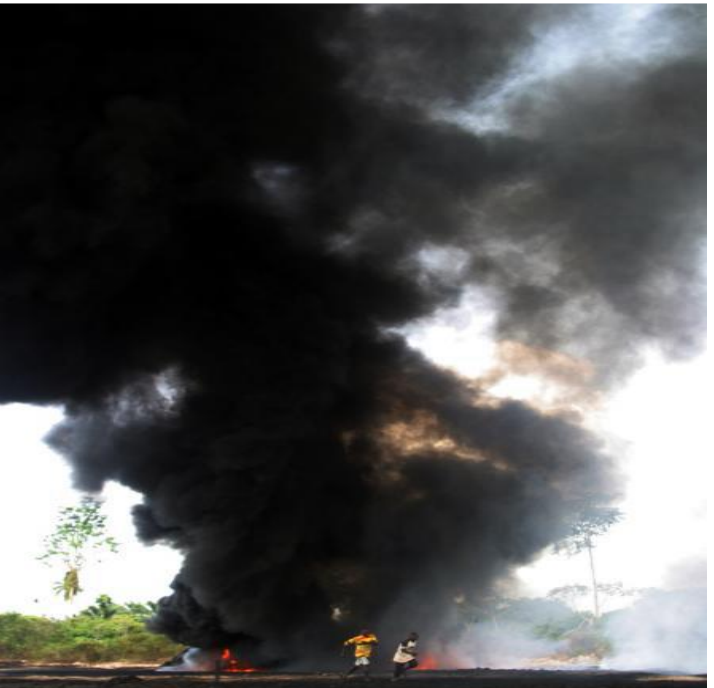
PLATE 2. Niger Delta pollution (Oyekunle, 1999; Tawari and Abowei, 2012).

The lungs and airways: All inhaled pollutants, primarily target the lungs. The lungs, located on each side of the thorax are spongy air- filled organs. The lung airway starts from the trachea (wind pipe) in which air enters the lungs from its tubular bronchi. The main bronchi divide into lobar bronchi, two each on the left and three on the right, each lobar bronchi divides into several segmental bronchioles that eventually ends as terminal bronchioles that give rise to several generations of respiratory bronchioles entering into the alveoli sac where gaseous exchange take place. There are 480 alveoli in each lobe of an adult human, with men having more alveoli and larger lung volumes (Ocths et al ; 2003). Each day humans breathe about 15m^2 of air with total lung volume of 1400m^2 . At rest, a healthy adult has about 400-500ml of lung volume and breathing frequency of about 15-17bpm.