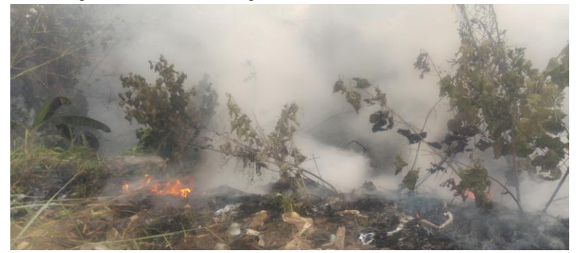
PLATE 3. A refuse dump site at Etegwe Yenagoa, Bayelsa State

such as refuse and bush burning, burning of tyres, plastic and rubber materials in abattoirs which generates more than enough soot (black carbon) in this region which has become a source of worry especially to the inhabitants of Yenagoa, Bayelsa state. Soot in Yenagoa comes from activities in abattoirs, refuse burning (at dump sites), bush burning, vehicular emissions and illegal refineries from nearby communities.