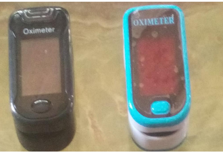
Fig.2. Contec CMS5ON Fingertip Pulse Oximeter