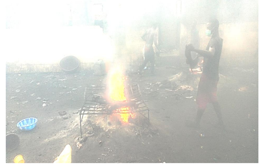
PLATE 1. Emissions from Swali Abattoir in Yenagoa City, Metropolis.

About 6.5 million deaths around the world are also attributed annually to poor air quality inside and outside (ambient air), thus making air pollution the world's fourth largest threat to human health behind blood pressure, dietary risk and smoking (Funmi, 2018). Decades ago, the consequences of combustion related air pollution indicated by black smoke were monitored when assessing air quality and its effects on health were used as evidence to recommend the first guide lines for exposure limits in line with the protection of public health in Europe (Nicole, 2012). Soot is one of the major pollutants in the Niger Delta region.