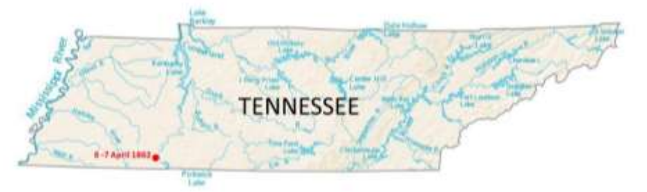
Figure 1. Major riverways and Battle of Shiloh (red) located on the west Tennessee River bank, north of the Mississippi-Tennessee state line.

Union control and most of Tennessee was also occupied, including Nashville. A battle was inevitable, since control of the region would provide a major strategic attainment to the victor. Indeed, Shiloh was the scene where some 24,000 were killed or wounded, delivering a shocking prelude to both sides regarding what would come later in the war.