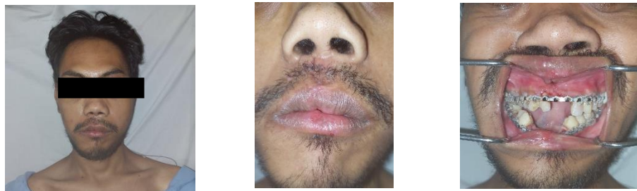
Figure 6. Post-Emergency Procedures for inserting interdental wires, intermolar wires and suturing the wound on the 7th day

maintained. The wound in the palate region has not been completely closed, and Hyaluronic Acid gel is still being administered to the area. Patients are still instructed to consume a liquid diet.