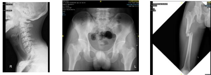
Figure 3. Examination of trauma series in cases of multiple trauma

The results of the X-ray examination of the chest, Cervical, and Pelvis found no abnormalities, whereas the X-ray of the femur found discontinuity in the dextra femur (Figure 3). 3D CT scan findings found discontinuities of the facial bones on bilateral frontonasal bones and frontozygoma, bilateral orbital bones of the median and inferior aspects of the rim, left zygoma, nasal bones, maxillary bones, mandibular symphysis bones (figure 4)