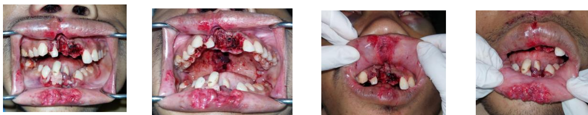
Figure 2. Intra-oral examination found lacerations, fractures and open bite malocclusion

gingival lacerations 32-43. Palatal fractures were also found to make holes in the palate accompanied by lacerations measuring 4x3x2 cm. Features of malocclusion with an open bite were also found in this patient.