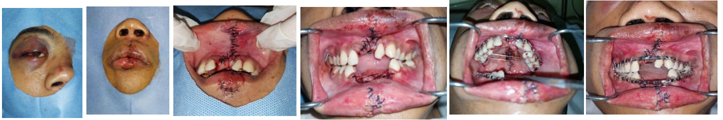
Figure 5. Post Operative Emergency Treatment

Seven days after the emergency procedure, the patient underwent suture opening in the extra oral and intra-oral areas, the wound was closed quite well, but the intermolar and interdental wiring of the upper and lower jaws was still