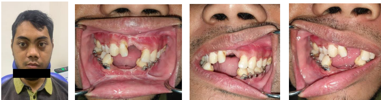
Figure 9. Postoperative control on the day 40

On the 40 days postoperatively, control was carried out again and a better clinical condition was obtained; the occlusion was stable, complaints of no longer feeling surgical pain had disappeared, swelling had also disappeared, and removal of the interdental wiring was performed on the maxilla (figure 9).