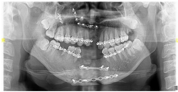
Figure 8. Post ORIF 1 month panoramic photo

On the 40 days postoperatively, control was carried out again and a better clinical condition was obtained; the occlusion was stable, complaints of no longer feeling surgical pain had disappeared, swelling had also disappeared, and removal of the interdental wiring was performed on the maxilla (figure 9).