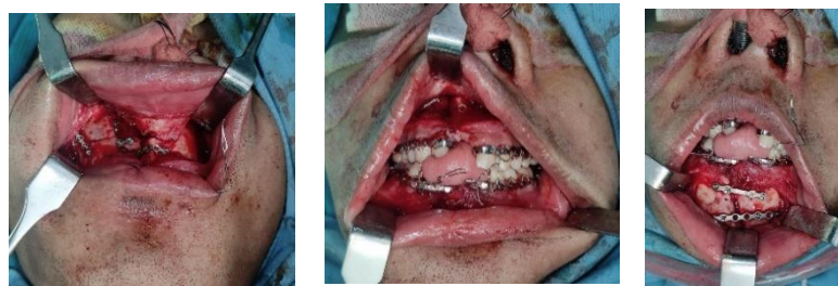
Figure 7. ORIF was performed by placing a plate on the maxillary and mandibular fracture

After 14 days of trauma, the patient continued definitive treatment for fractures of the facial bones, namely open reduction internal fixation using plates and screws placed on the fracture line. First, a plate was placed on the mandible, and occlusion adjustments were made. After the fracture fragment and stable occlusion, a plate and screw were placed on the maxilla using an L plate and straight with a diameter of 1.6, and then the occlusion was adjusted and achieved.