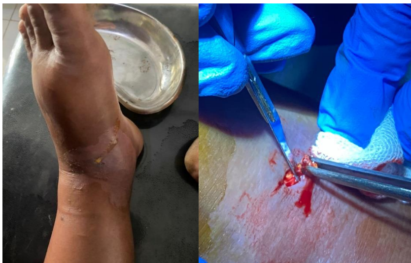
Figure 1. (a) Pus oozing out from small draining port with 0,3 cm diameter in the bitten limb. (b) Fibrinopurulent pus with yellow-coloured-cheese like appearance,

On physical examination, the patient was fully conscious and calm. Blood pressure measured 120/70, pulse rate 72x/m regular, equal, full, respiration 18x/m. Weight and height are unknown, but patient seems to be overweight. General status is within normal limits. On local examination found swelling and erythema in cruris sinistra and pedis sinistra with oedema and numbness in dorsum pedis sinistra area, limited range of motion of the left ankle. Dorsalis pedis artery pulsation cannot be detected. Fang marks shape of snake bite have not been seen, just seems pus oozing out from small draining port with 0,3 cm diameter. When pus has been removed, seems a yellow-coloured-dense tissue in draining port. Laboratory examination cannot be performed because of limited equipment and facilities. From anamnesis and physical examination revealed diagnosis cellulitis post-snakebite.