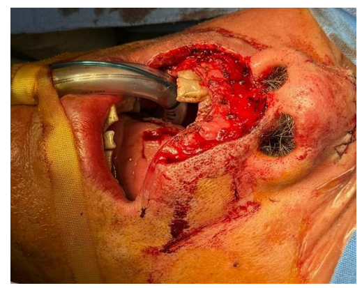
Figure 2. Preoperative image

be necessary. The lip tissue comprises the epidermis, muscular layer, vermilion, and oral mucosa, exhibiting a distinctive structure not commonly found in other body regions. Consequently, utilizing adjacent lip tissues for lip reconstruction is appropriate. If the lesion encompasses over 35% of the lip, flap reconstruction is imperative, necessitating consideration of adjacent regions, including the unaffected lip (Abbe type), cheek (Gilles or Estlander type), and chin (Bernard type).