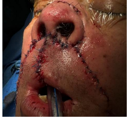
Figure 3. Postoperative image

mouth's corner was the optimal choice. Furthermore, the Abbe technique is inappropriate for the corners of the mouth. Given these factors, the Karapandzic flap technique was determined to be the most appropriate for the current case. The intact contralateral corner of the mouth serves as the basis for comparison. Regardless of the chosen lip reconstruction technique, asymmetry at the corners of the mouth will manifest. Insufficient muscle reconstruction, when the shape of the mouth is emphasized, can cause dispersion and numbness at the corners of the mouth, diminishing the effectiveness of the reconstruction. In our case, the corners of the mouth were preserved in an optimal position, and the progression was favorable with no complications, such as castration.