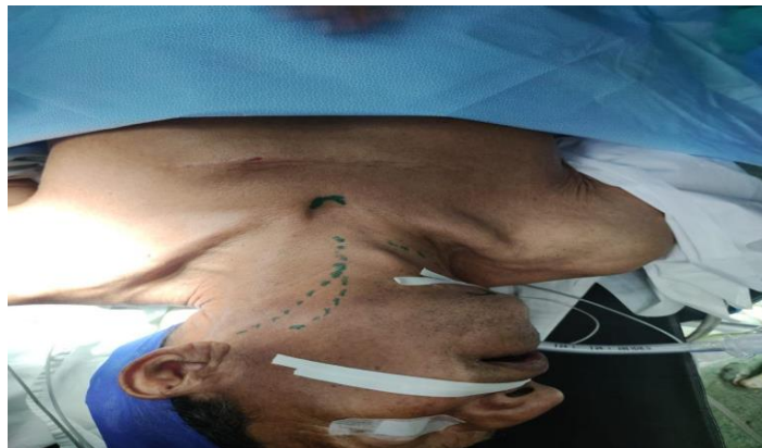
Figure 1. Preoperative marks.

Histopathology report 10/07/2022: ACUTE ABSCEDEDADA ESOPHAGITIS + ESOPHAGEAL CANDIDIASIS