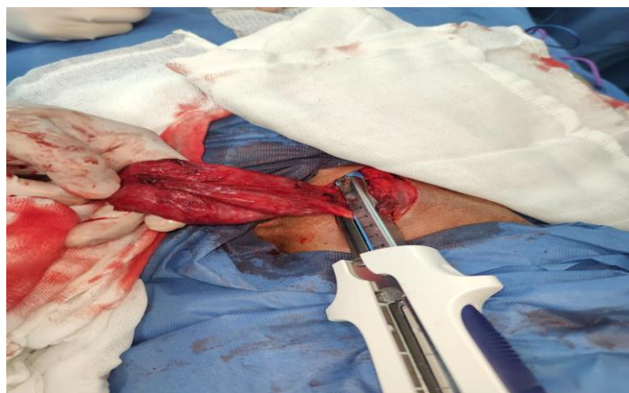
Figure 3. Diverticulum excision