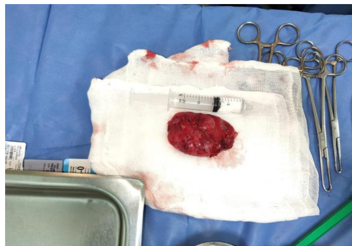
Figure 4. Surgical piece