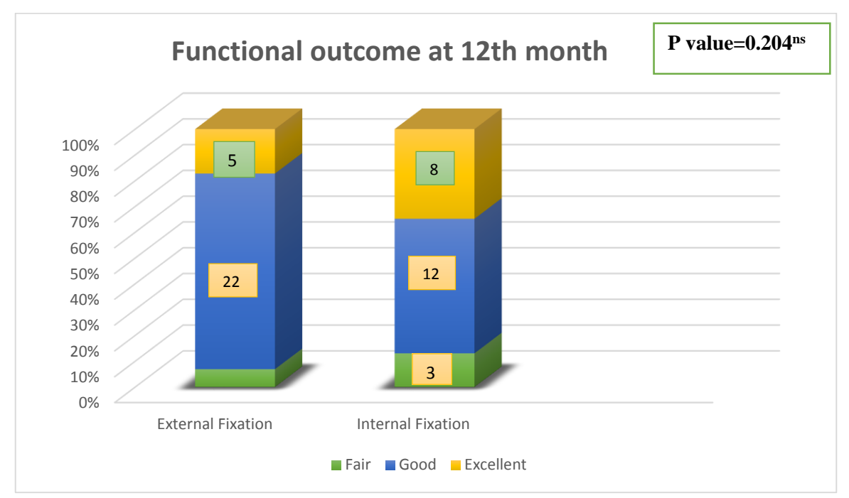
Figure 2. Distribution of the patients according to functional out come at 12<sup>th</sup> month and type of operation (n=52).